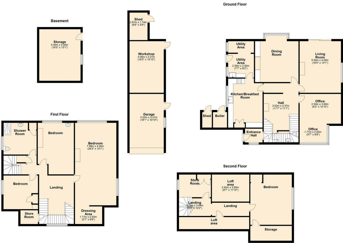
13 THE DRIVE, Ulverston

Corrie and Co aim to sell your property at the best possible price in the shortest possible time. We have developed a clear marketing strategy to ensure that your property is fully exposed to the local, regional and national market place and we are confident that we can provide a marketing service second to none. Our Sales Team offer: